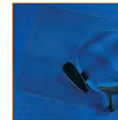
Tapete para protecção de alcatifa