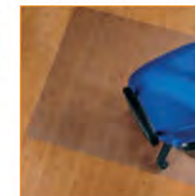
Tapete para protecção pisos duros